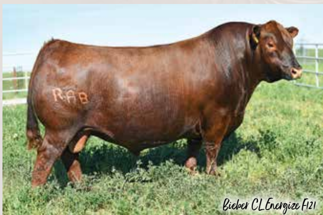
Bieber CL Energize F121

C-T Miss Pan 5091 was the high selling cow in the 2021 Big Sky Elite sale for $14,000. We chose to partner with the Hickle family because of this cows outstanding foot and leg structure, perfect udder and her production record. Combining the very best cow families from the C-T herd in Miss Pan and the Feddes herd in the Sleek cow family has proved to work very well. She boasts an MPPA of 106 and never misses. Her first son sold to Cross Canyon Ranch and was one of the top sellers that year. A full sister to these embryos was a highly talked about heifer at Bet On Red in 2022 selling to the Cox family in Washington. Resource 137E needs no introduction. His daughters are some of the top young cows in our herd and this mating could very well produce a donor cow or a herd bull. 5091 is a cow that we continue to flush and are excited to keep getting calves out of.