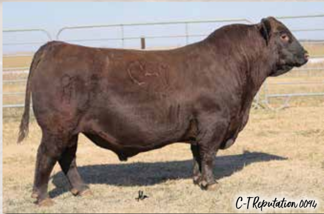
C-T Reputation 0094