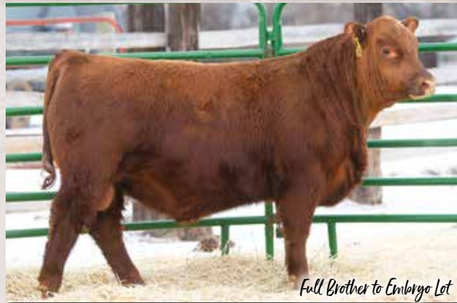
Full Brother to Embryo Lot