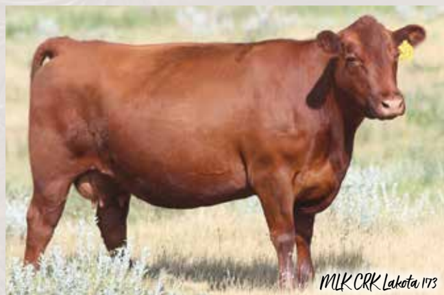
MLK CRK Lakota 173