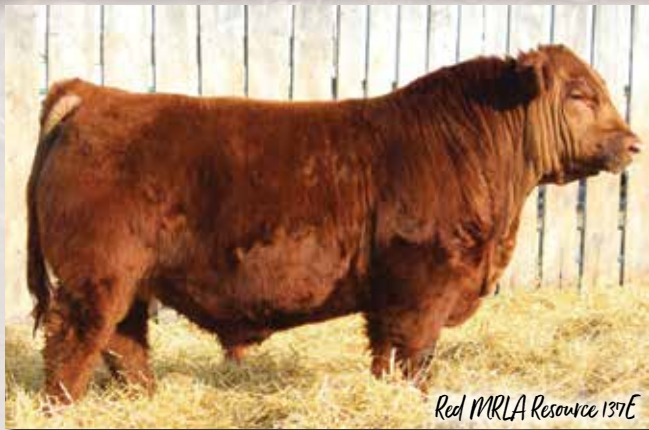
Red MRLA Resource 137E