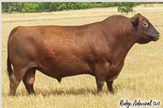
Ridge Admiral 3411

This opportunity will not come around often!! A full brother to this mating sold this spring in our bull sale for $17,500 to Watkins Cattle Co. in Arkansas and 3K Land & Cattle in Texas. Proven mating here and you can get your hands on some of the coveted Reputation progeny. Feddes Manhattan 2282 was a phenotypically flawless bull with extreme depth, dimension, muscle definition and yet had a nice front end. We used 2282 very heavily this spring and are excited to get those calves. The dam of these embryos has Red Angus royalty running through her veins with Feddes Blockana, LASO Leanna, C-T Linsey, 5L Firefly, CTDB Verdi and JYJ MS Jolene. The cow families here should say it all. 0100 carries a 117 MPPA on her first calf with BR 100, WR 129, YR 119 and IMFR 113. Cow families, growth and carcass! This mating is part of the future of Feddes Red Angus and this is the only time this mating will be offered in the near future.