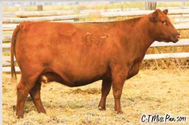
C-T Miss Pan 5091